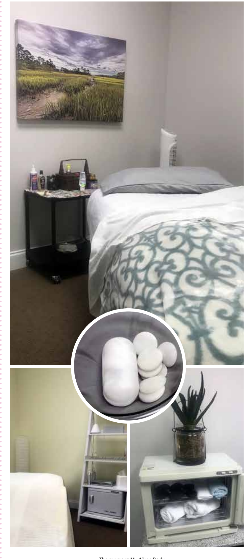
The rooms at My Aiken Body

My Aiken Body Therapeutic Massage www.myaikenbody.com 803-761-1127 830 Colony Parkway Aiken, SC 29803